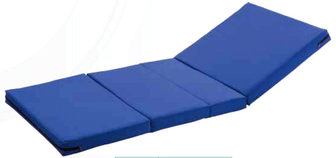
GNS2840 4 Part Ecco Sponge