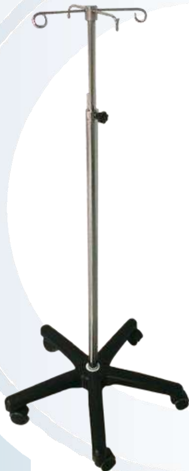
GNS2220 Stainless IV Pole