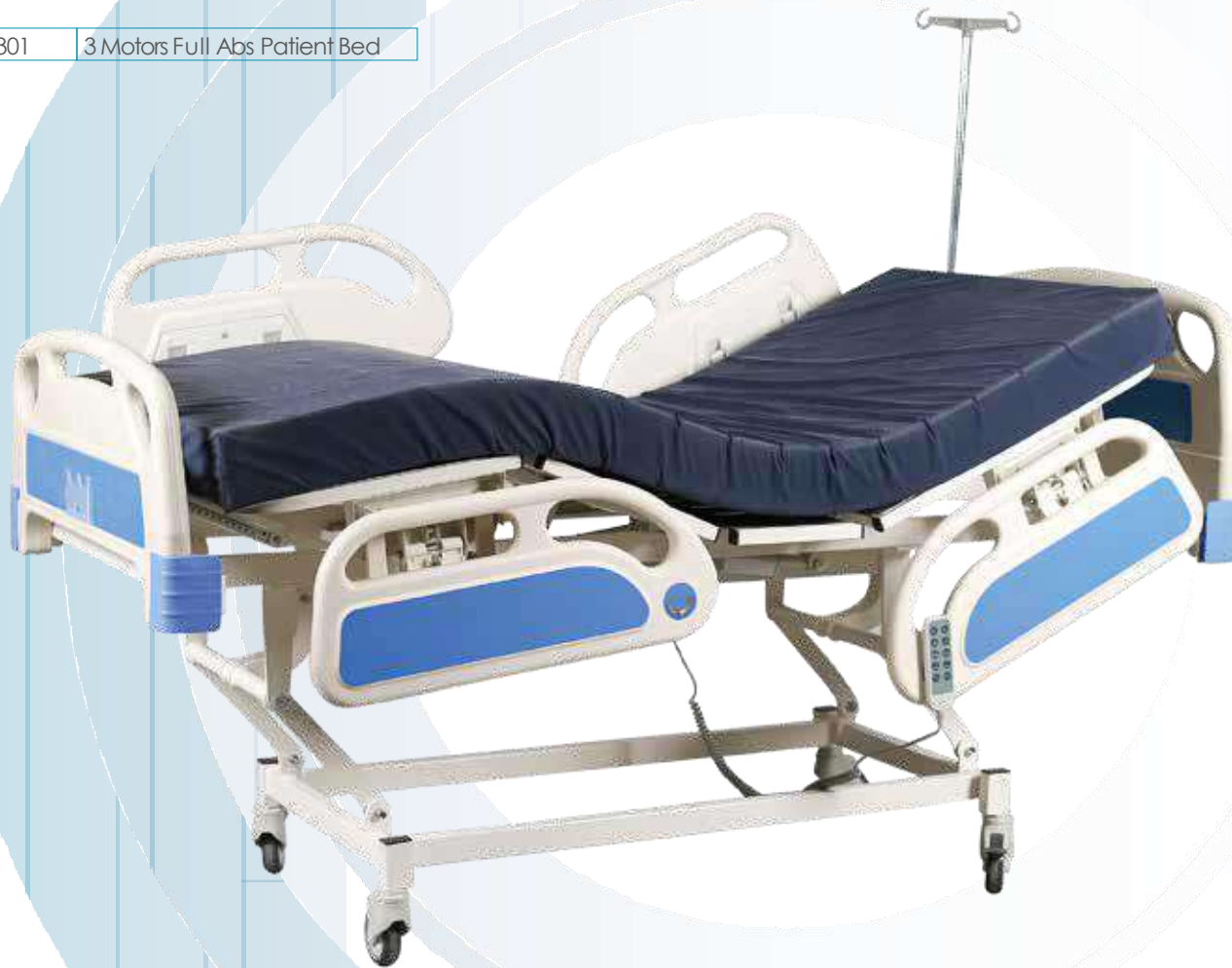
GNS-301 3 Motors Full Abs Patient Bed