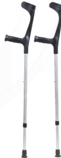
GNS2120 Bronze Bright Canadian