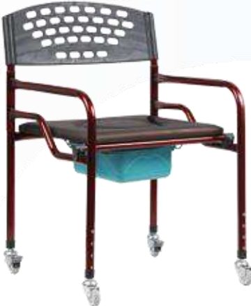
GNS1003 | Leather Coated Toilet Seat Riser With Wheels