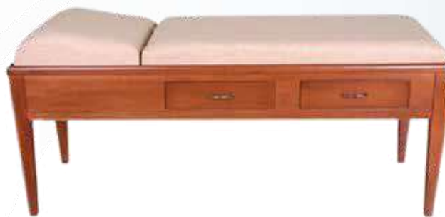
GNS260 | Wooden Examination Table