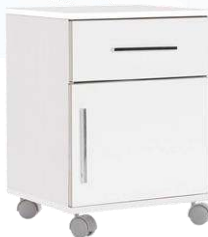
GNS2620 Wooden Bedside Cabinet