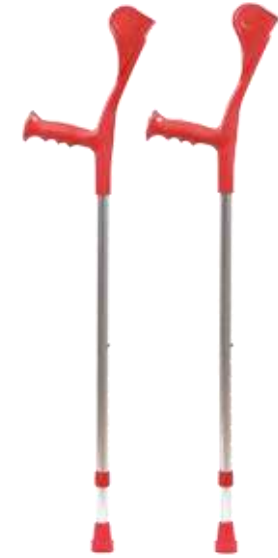
GNS2121 Anodized Bright Canadian