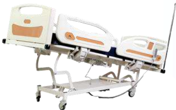
GNS 402 4 Motors Full ABS Patient Bed