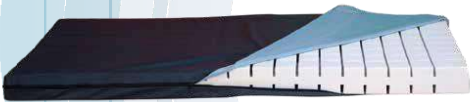
GNS2820 Lazer Cut Sponge Mattress