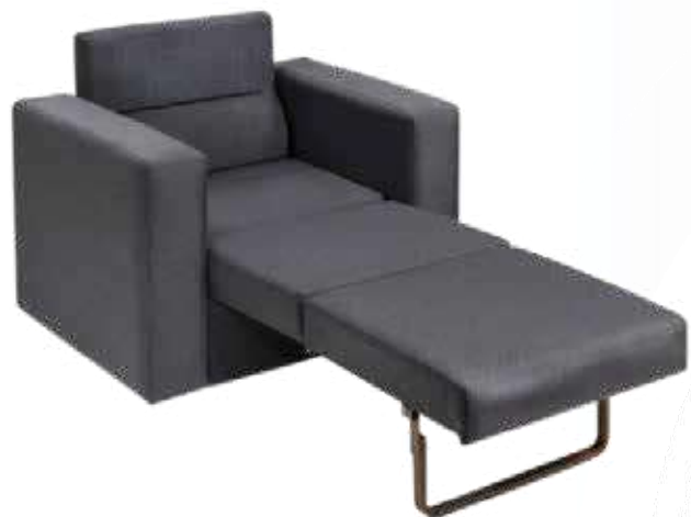
GNS2700 | Leather Coated Attendant Coach