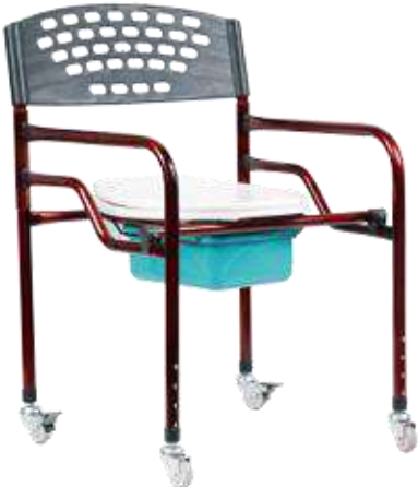
GNS1001 | Toilet Seat Riser With Wheels and Lid