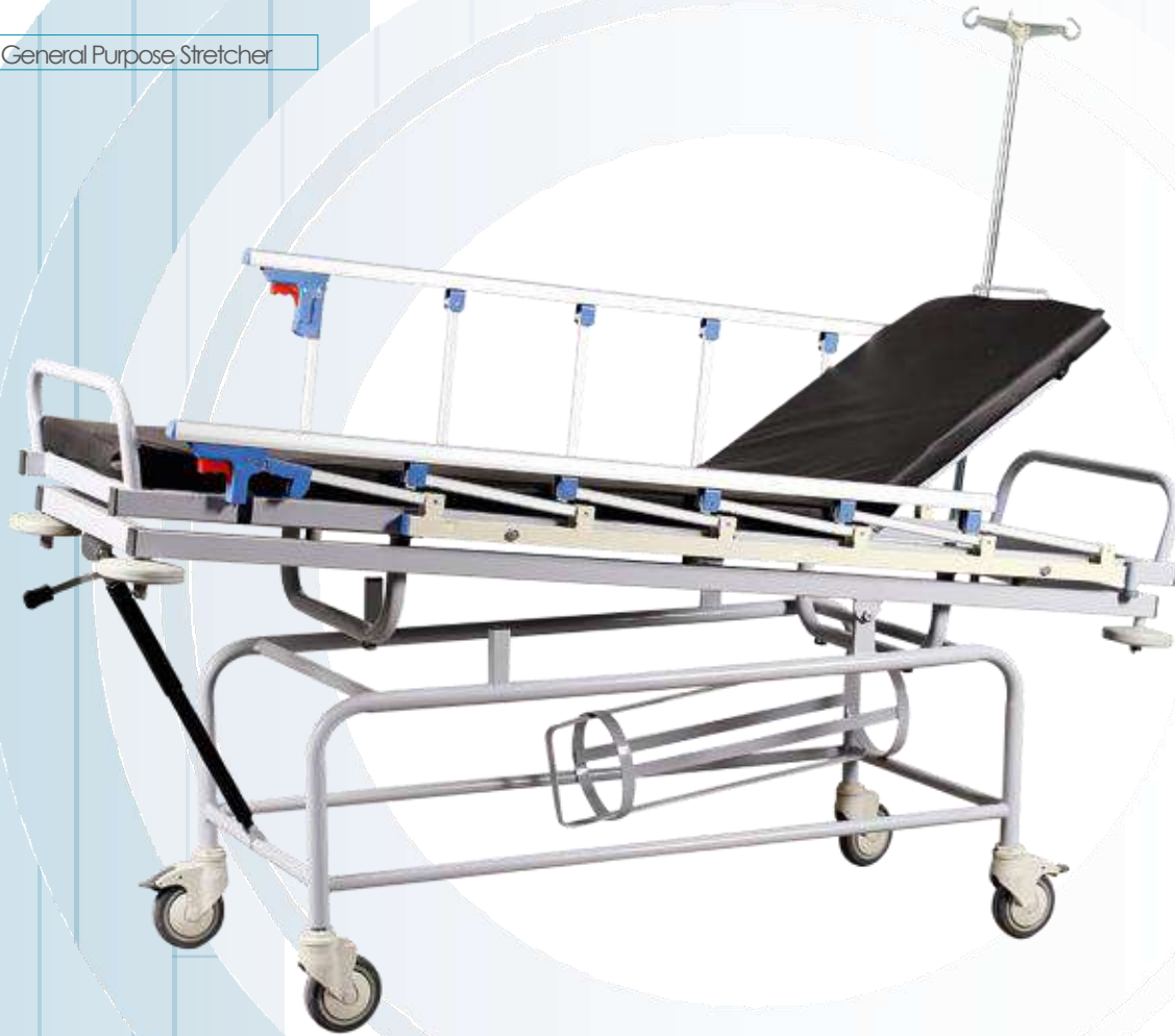
GNS230 General Purpose Stretcher