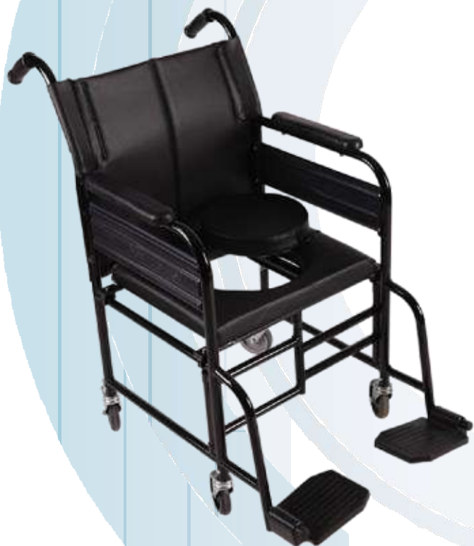
GNS1010 Corridor and Bath Chair With Wheels