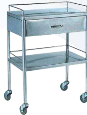
GNS2450 Instrument Table With Drawer