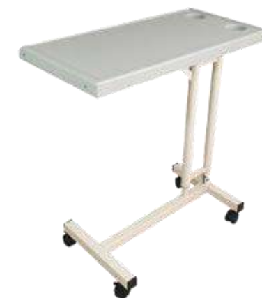
GNS2420 Hydraulic Mayo Table