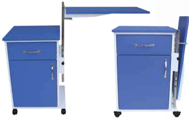
GNS2430 Combined Bedside Cabinet