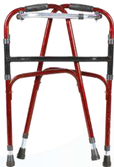
GNS2020 Metal Walker