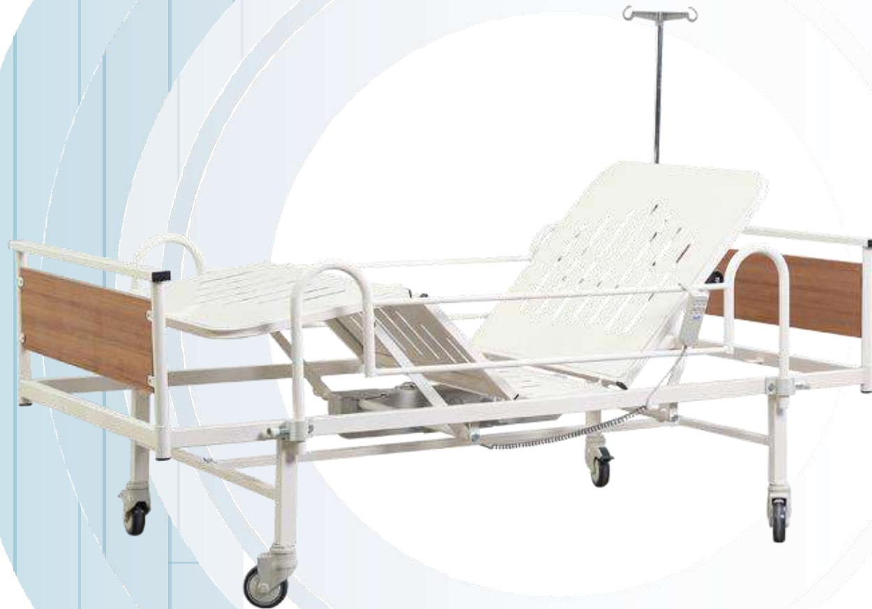
GNS101 | 2 Motors Eco Foldable Leg Patient Bed