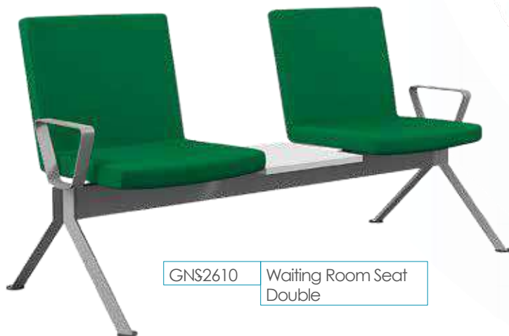
GNS2610 Waiting Room Seat Double