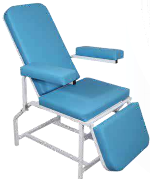
GNS220 | Blood Transfusion Chair