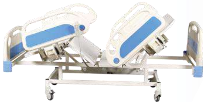
GNS104 2 Motors Full ABS Patient Bed