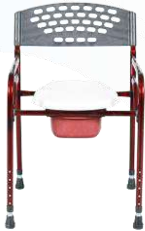
GNS1000 Toilet Seat Riser With Lid