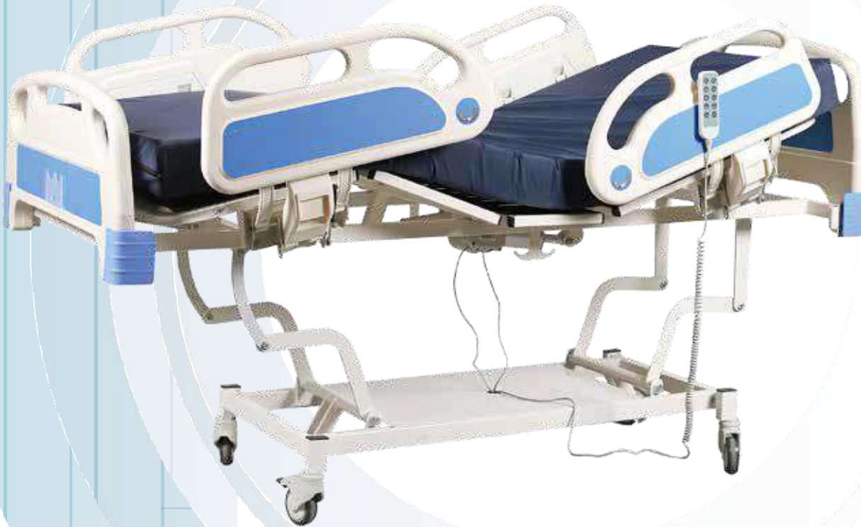
GNS-401 4 Motors Full ABS Patient Bed