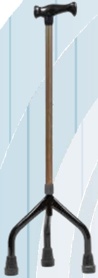
GNS2130 BronzeBright Tripod