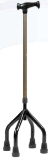
GNS2140 Bronze Bright Tetrapod