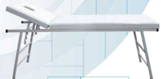
GNS250 Massage Table