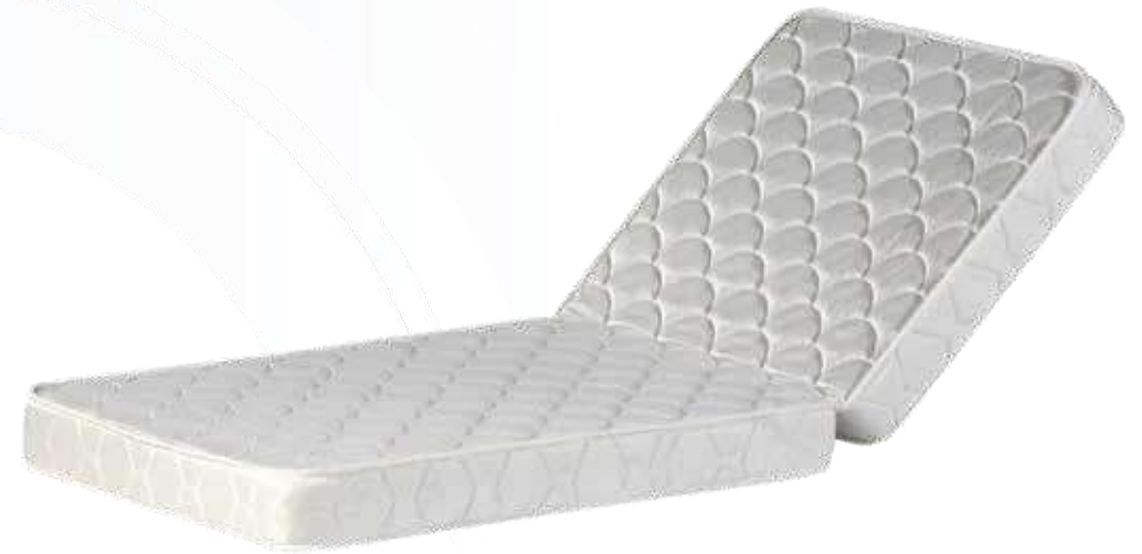
GNS2830 Orthopedic 2 Part Lazer Cut Mattress