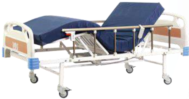
GNS10001 2 Motors With Side Rails Foldable Leg Patient Bed