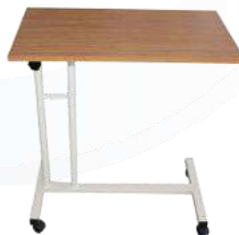
GNS2400 Wooden Mayo Table