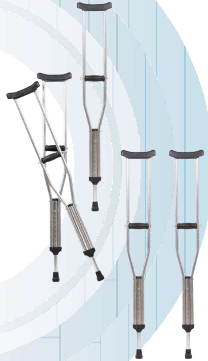
GNS2100 Anodized Bright Crutches