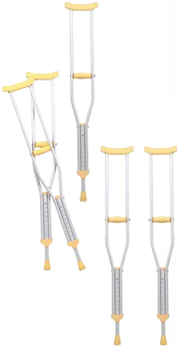
GNS2100 Anodized Bright Crutches