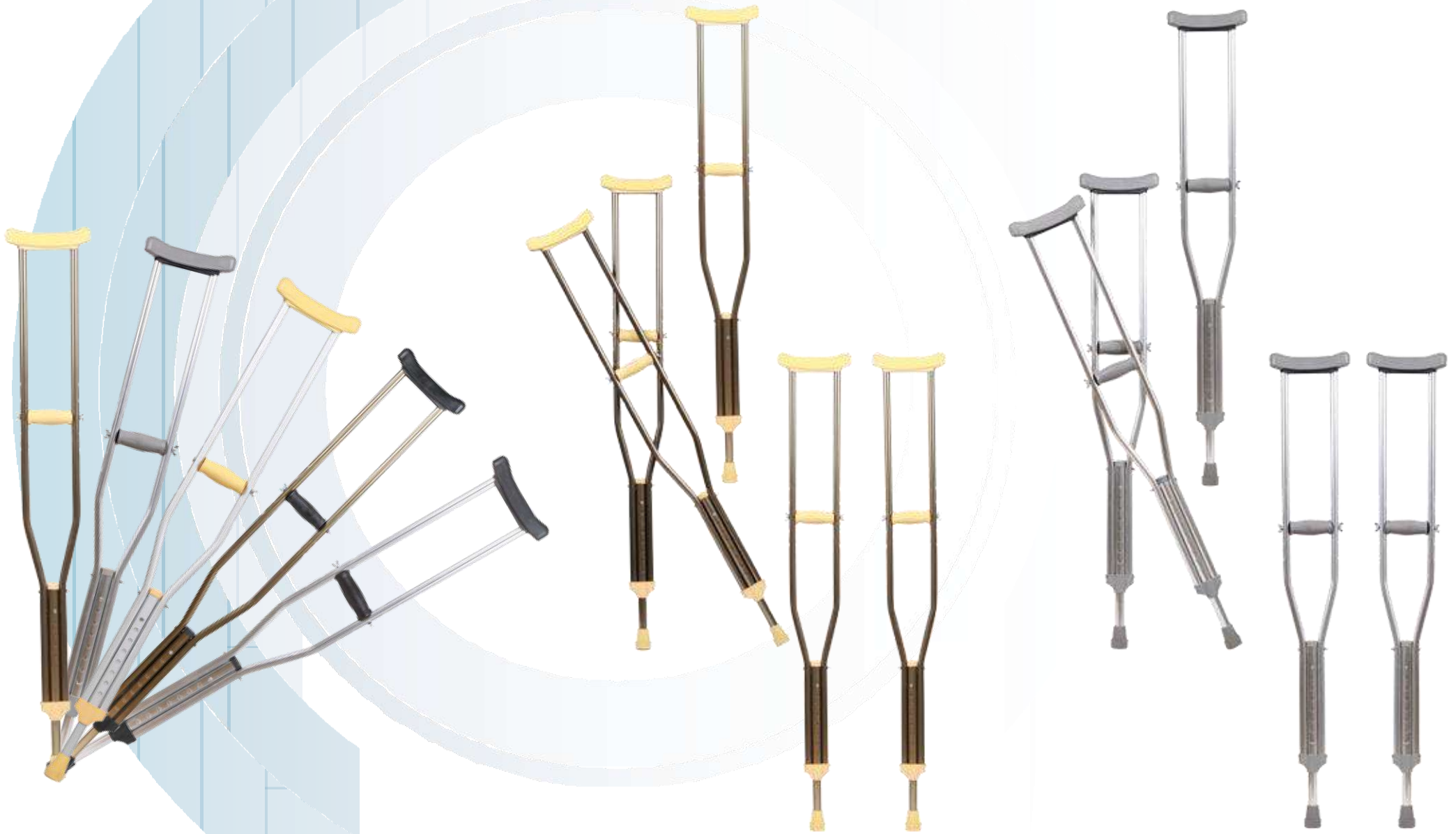
GNS2110 Anodized Bronze Bright Crutches