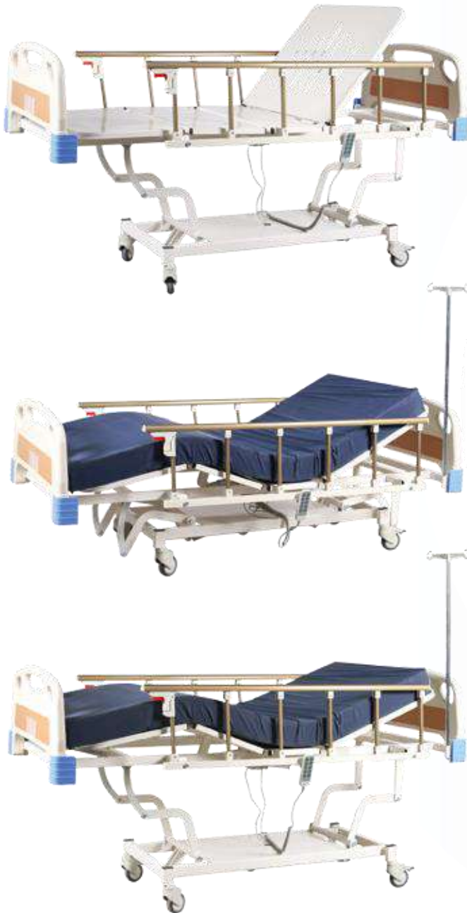
GNS-400 4 Motors Rail Type Sides Patient Bed