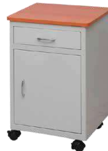
GNS2630 Metal Bedside Cabinet