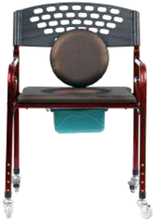
GNS1003 | Leather Coated Toilet Seat Riser With Wheels