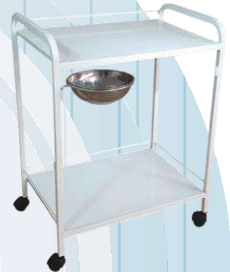
GNS2440 Eco Instrument Table