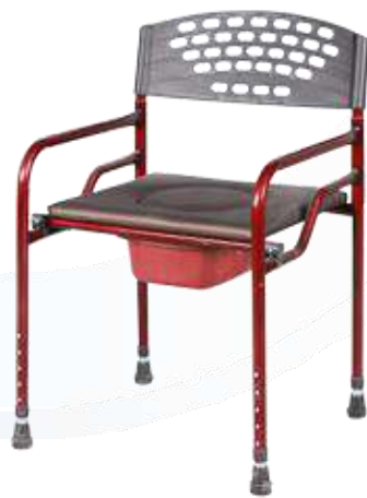
GNS1002 Leather Coated Toilet Seat Riser