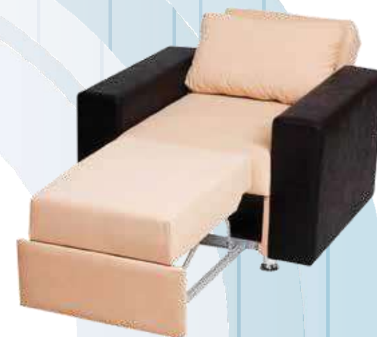
GNS2710 | Fabric Coated Attendant Coach