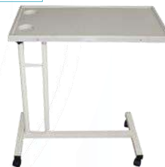
GNS2410 ABS Mayo Table