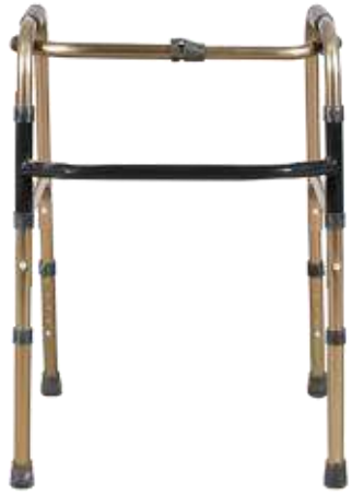
GNS2010 | Anodized Bronze Aluminum Walker