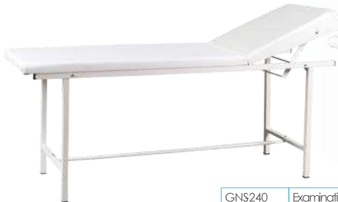
GNS240 Examination Table