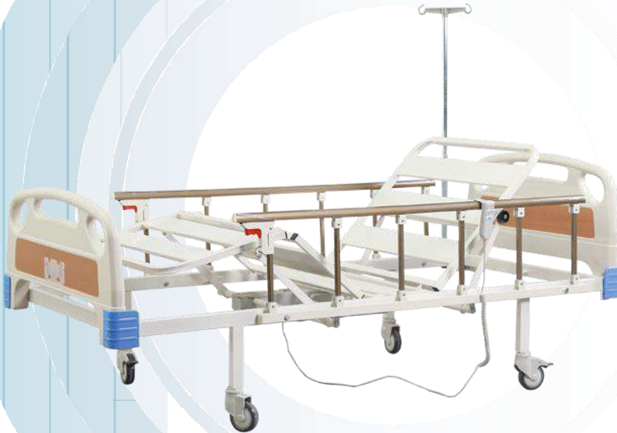
GNS102 | 2 Motors With Side Rails Fixed Leg Patient Bed