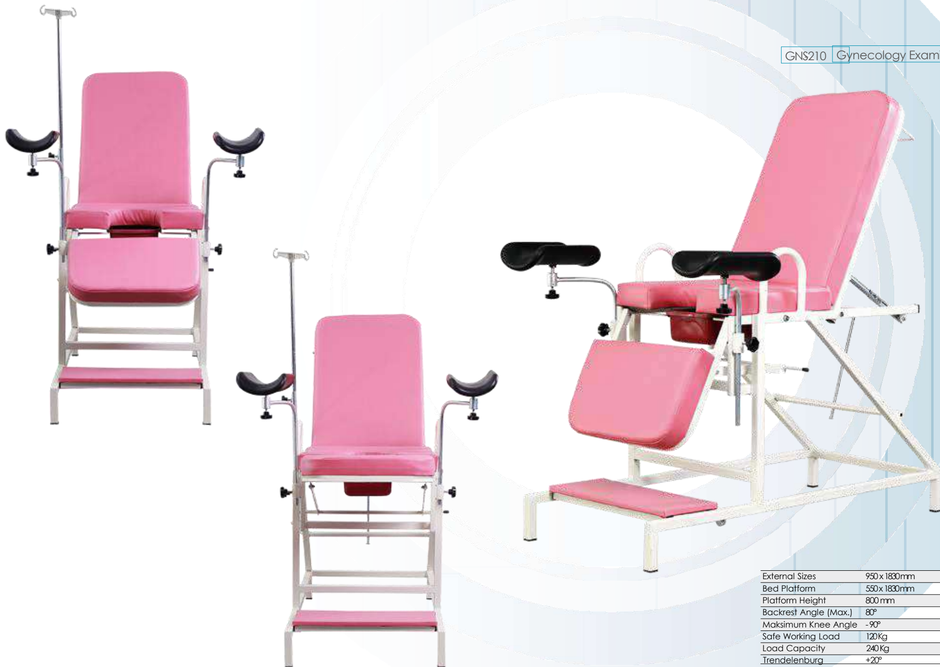
GNS210 Gynecology Examination Table