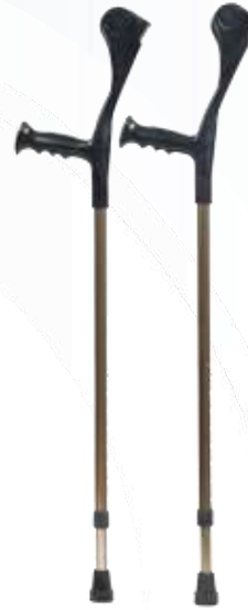
GNS2120 Bronz Bright Canadian