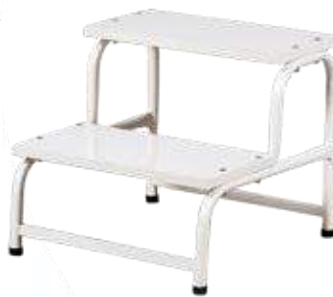
GNS2200 2 Steps Escabbo