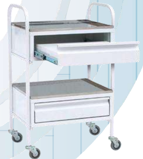
GNS2460 Instrument Table With Drawer