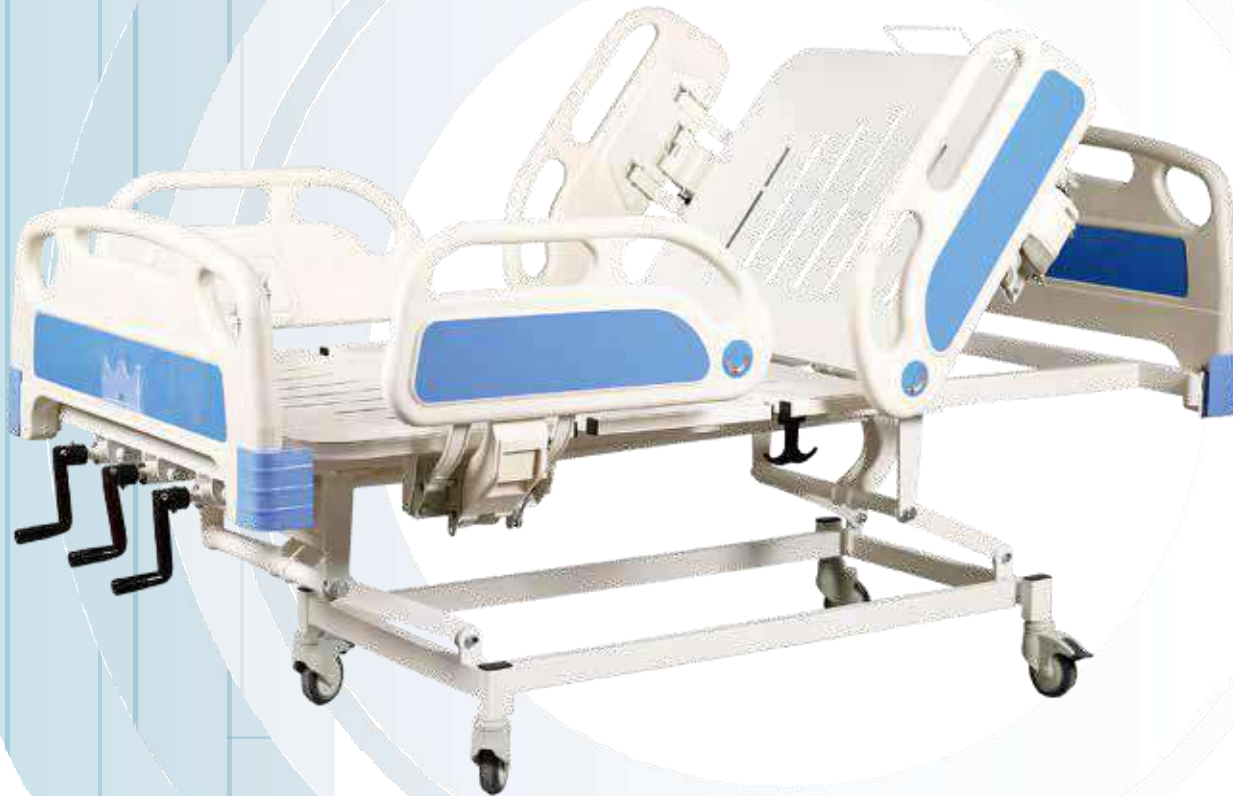
GNS302 3 Adjustment Manuel Full ABS Patient Bed