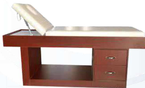
GNS270 | Wooden Massage Table