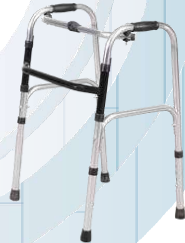
GNS2000 | Anodized Bright Bronze Aluminum Walker