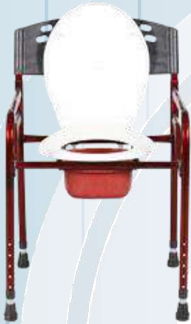
GNS1000 Toilet Seat Riser With Lid