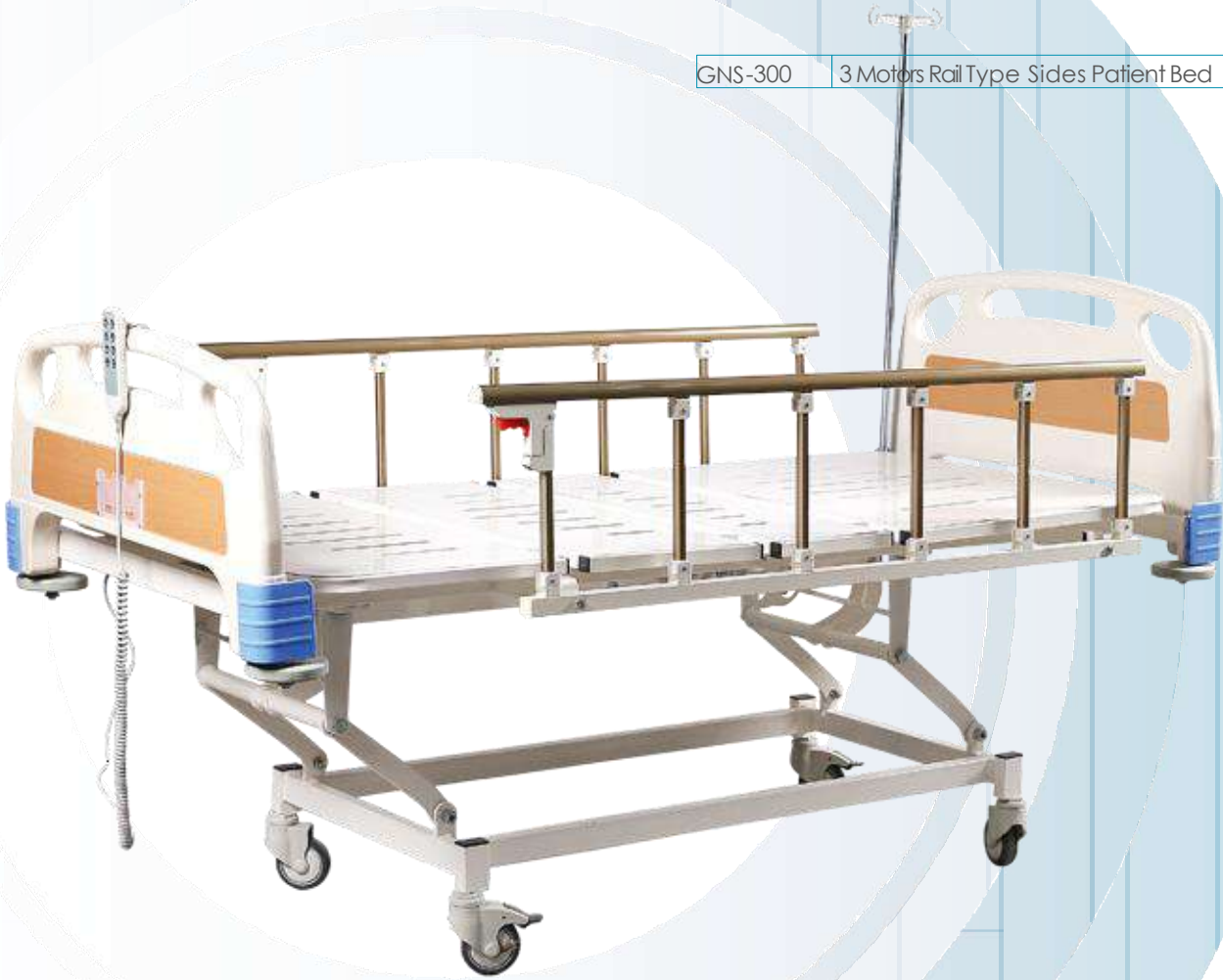
GNS-300 3 Motors Rail Type Sides Patient Bed