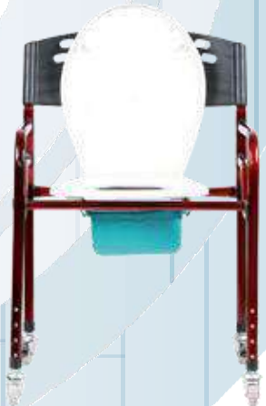
GNS1001 | Toilet Seat Riser With Wheels and Lid