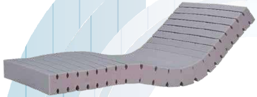
GNS2820 Lazer Cut Sponge Mattress