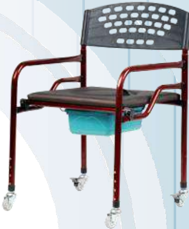
GNS1003 | Leather Coated Toilet Seat Riser With Wheels