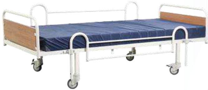
GNS100 2 Motors Eco Fixed Leg Patient Bed