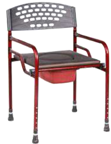
GNS1002 Leather Coated Toilet Seat Riser