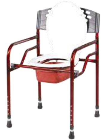
GNS1000 Toilet Seat Riser With Lid