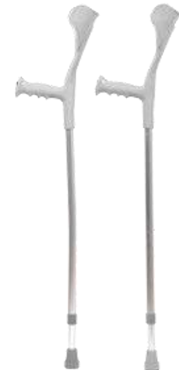
GNS2121 Anodized Bright Canadian