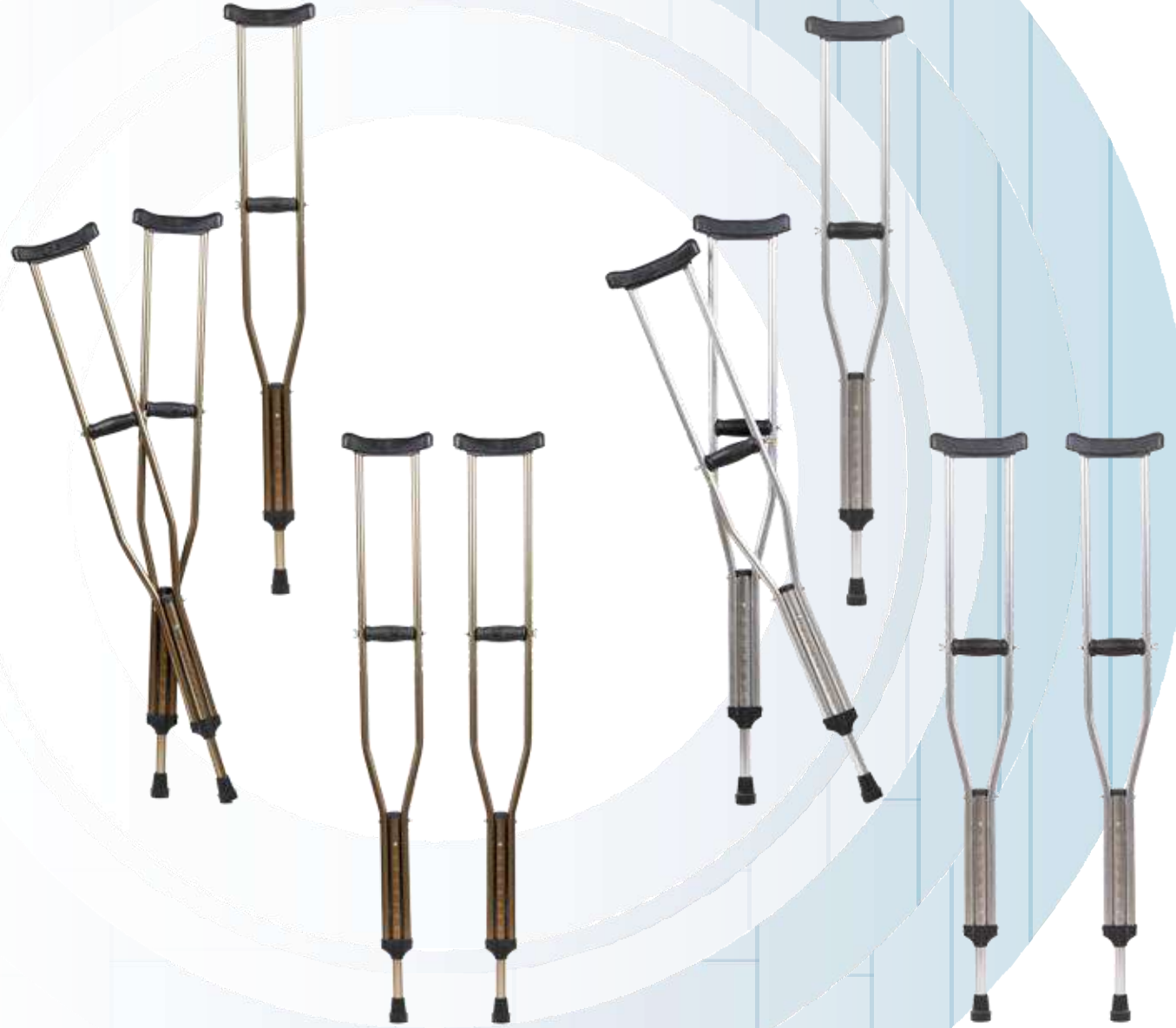
GNS2110 Bronze Bright Crutches