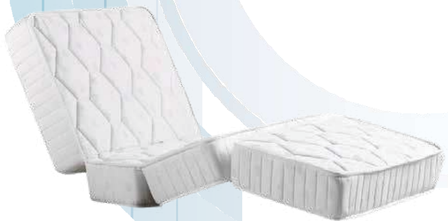
GNS2810 Orthopedic 4 Part Lazer Cut Mattress