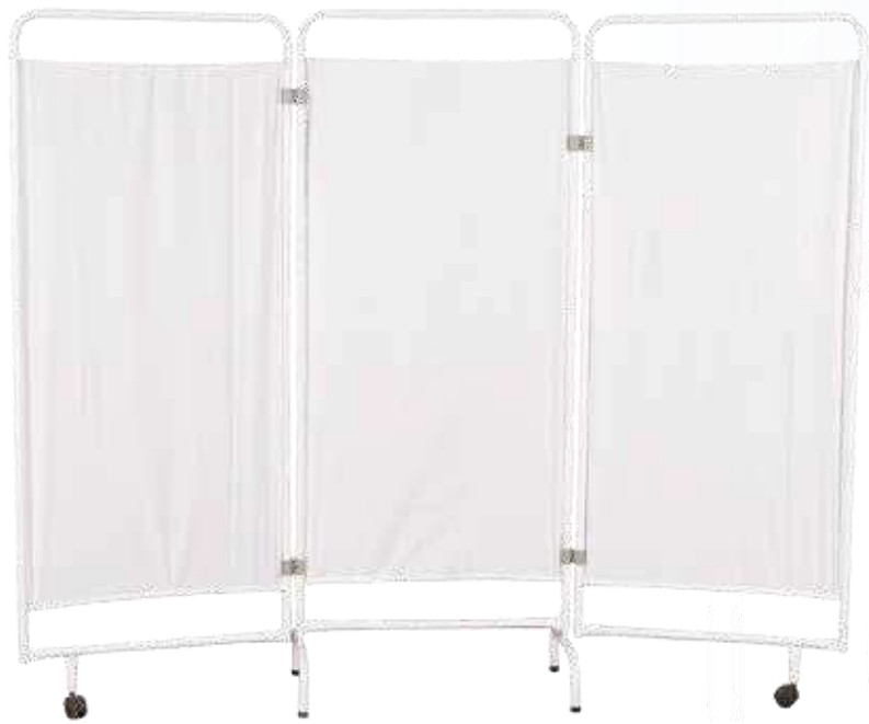
GNS2160 3 Wings Screen