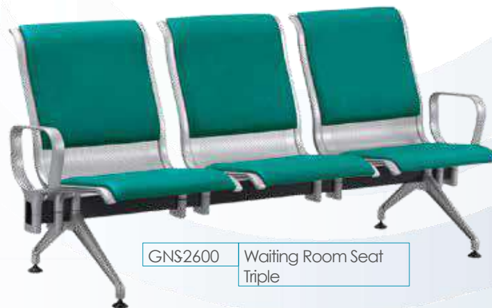
GNS2600 Waiting Room Seat Triple