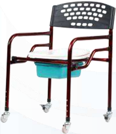
GNS1001 | Toilet Seat Riser With Wheels and Lid