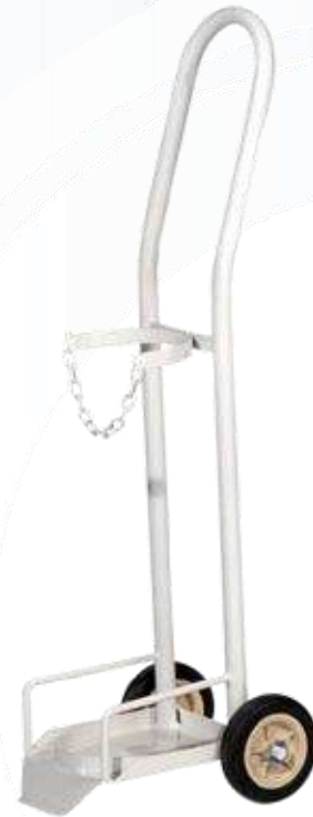
GNS2210 Oxygen Cylinder Carrier